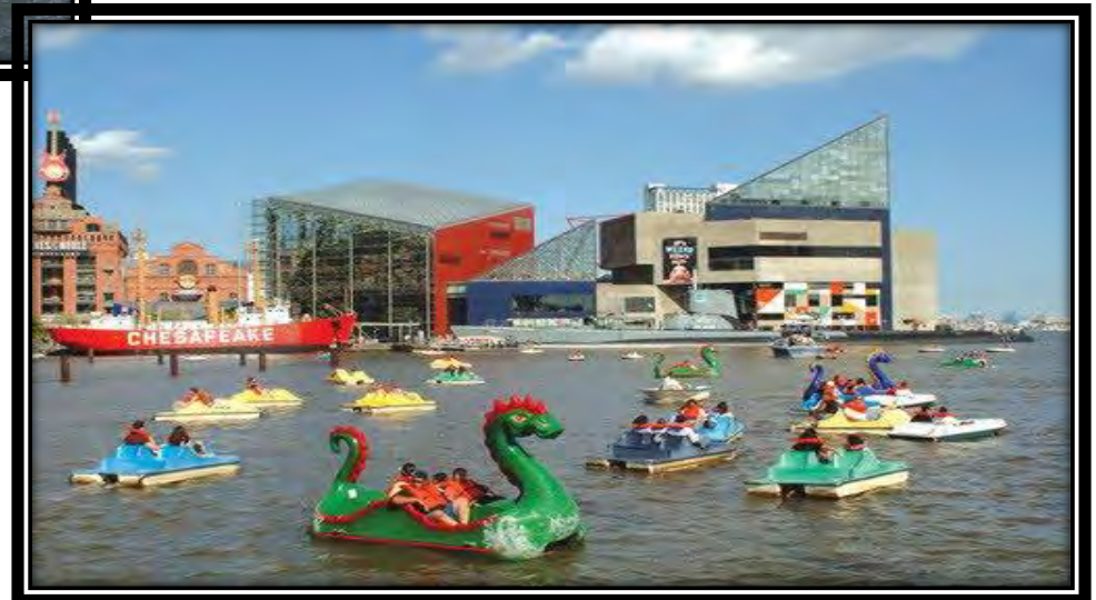
Pedal Boats & The Aquarium in the Background