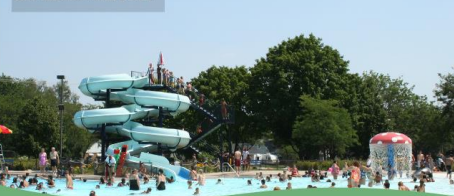
RICHMOND PARK POOL